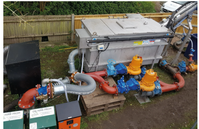
Figure 2. Screen Arrangement & Screen Discharge Pumps