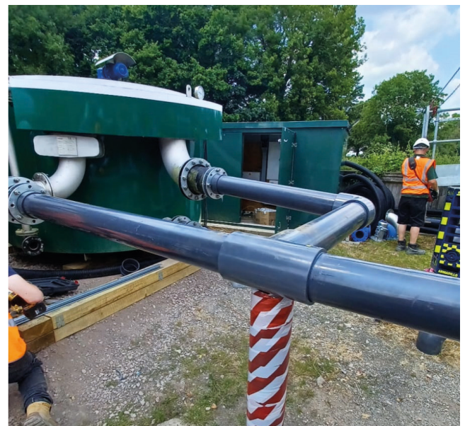
Figure 5. MITA temporary pipework Installation