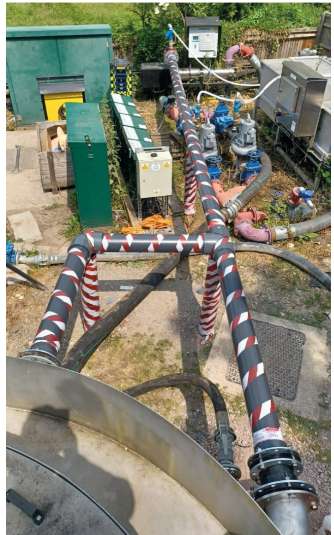
Figure 4. MITA Pipework Arrangement

As a result of the high TSS removal rate, this has also reduced the BOD and COD levels in the effluent due to the insoluble and inorganic solids removed by the filter. Prior to treatment the average BOD and COD was 32.1mg/l and 80mg/l, respectively. After treatment the average BOD and COD was 15.4mg/l and 30.6mg/l, respectively. This is over a 50% reduction in both parameters.