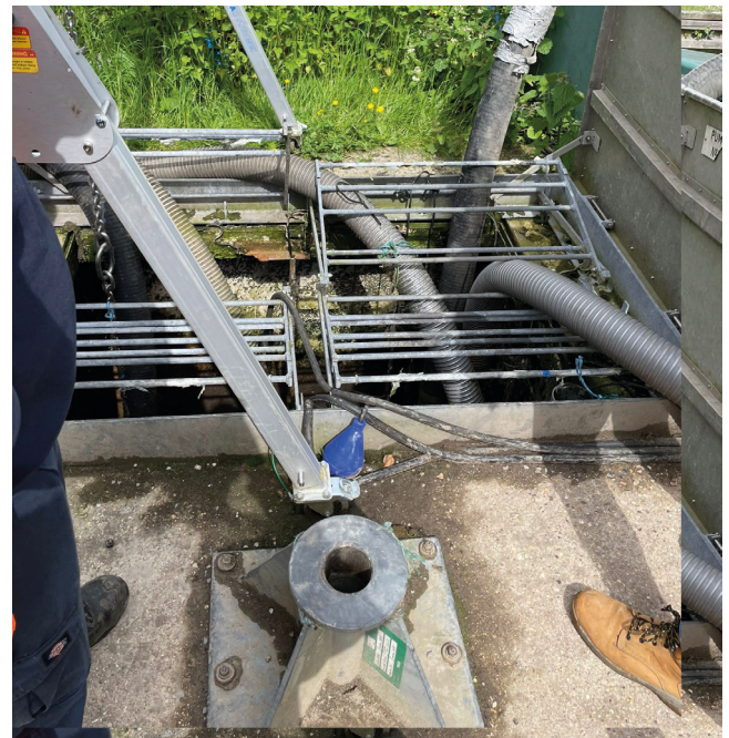
Figure 1. Over Pumping Pump Station

ATAC initially carried out a site visit to scope the feasibility of installing a cloth filter, gathering all information required and taking levels to ensure the hydraulics would work. The MITA 4/20 was installed on railway sleepers on top of a level type 1 base adjacent to the main MCC to raise the filter by 200mm ensuring the cloth filter could gravity discharge to the UV equipment. ATAC installed the inlet of the MITA filter on to the end of the screen outlet pumps via a flexible Bauer hose eliminating the need for additional diesel or electric pumps. The MITA filter outlet was installed in PVC pipework on pipe supports to allow it to discharge freely under gravity directly to the UV equipment. The cloth filter overflow pipework was joined into the outlet pipework to the UV equipment to provide a failsafe on the filter. The backwash pipework was installed in flexible Bauer hose and discharged back into the pump station wet well.