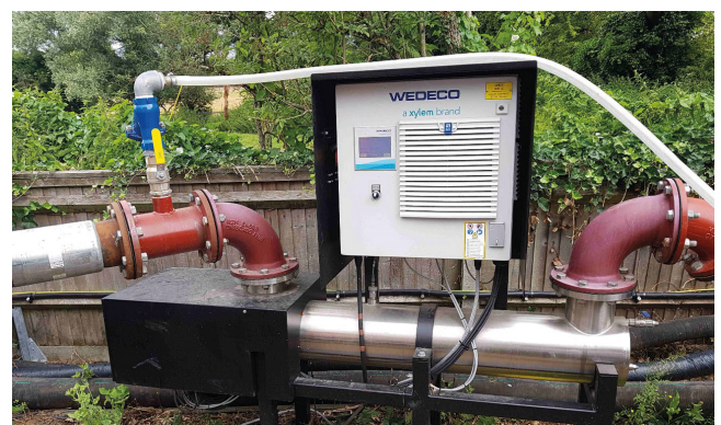
Figure 3. UV Dosing Equipment